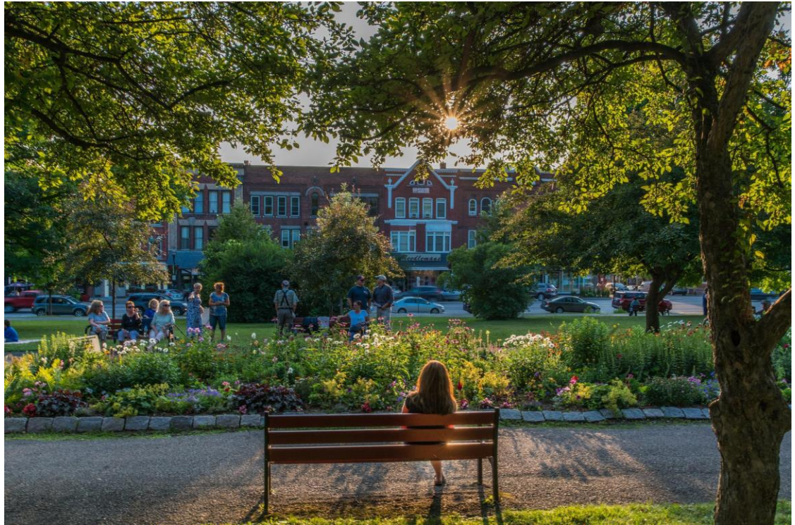
Town Square will be the location of the All-Class Reunion along with other fun celebrations during the last weekend of August

Built in 1843, The Wishing Tree Inn is owned by Neva Cabot of the original Linden Falls Cabots and was voted Most Quaint Inn in the Historic Inns of Vermont Collection. Authors of notoriety and celebration have been among the many guests, and some have inspired the roomy and beautiful writer-themed guest rooms. Stop by and have a cup of Neva's special tea and meet Myster and Charm, the inn cats that will have you swooning. Be sure to recommend the inn to all your family and friends! Book online or by phone.