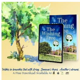
THE WISHING TREE

Wishes in branches tied with string. Someone's hopes. Another's dreams